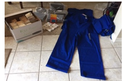
Right: Item Arrived in Haiti/Bethel Hospital